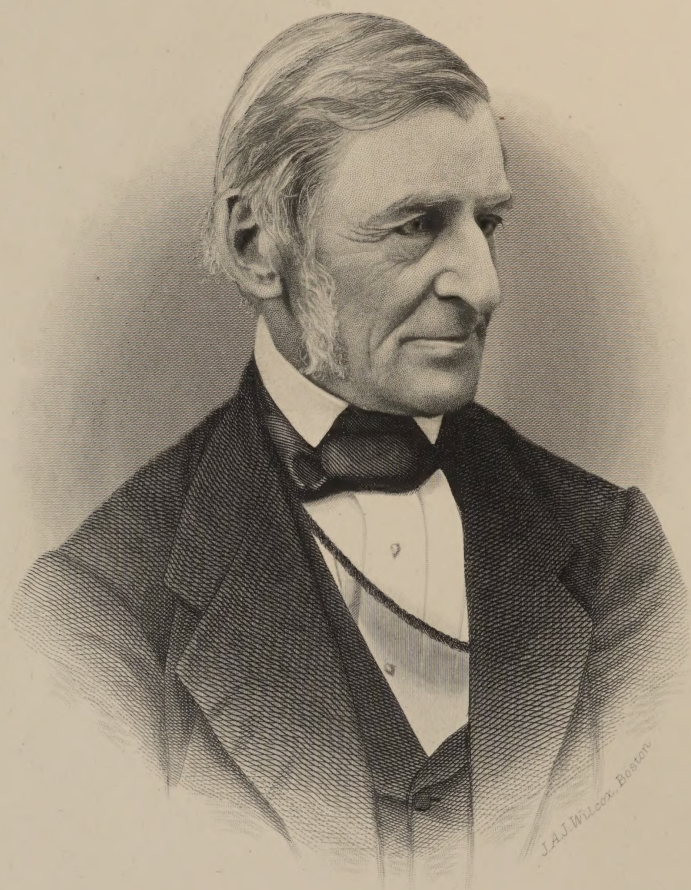
R. Waldo Emerson